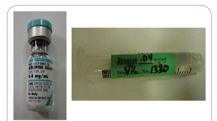
Figure 3Example of concentration error - 0.04 mg/ml instead of<br/>0.4 mg/ml Atropine.