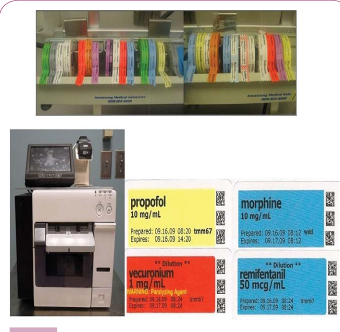
Figure 1 Coventional labela vs. Bar code-assisted labels.

After obtaining institutional review board approval, we contacted