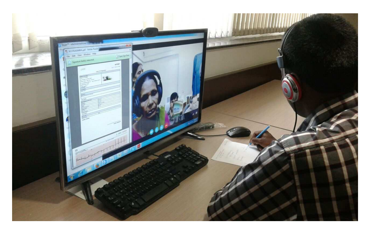
Doctor at Central Site Counseling the Patient at Remote Site

Providing healthcare to its citizens and creating jobs are two primary goals of any Government. Expanding health coverage, especially in rural areas, poses two major challenges. First, it requires significant financial investment to set up and staff medical facilities. Second, skilled healthcare professionals prefer to live in urban areas, and are thus scarce in rural areas.